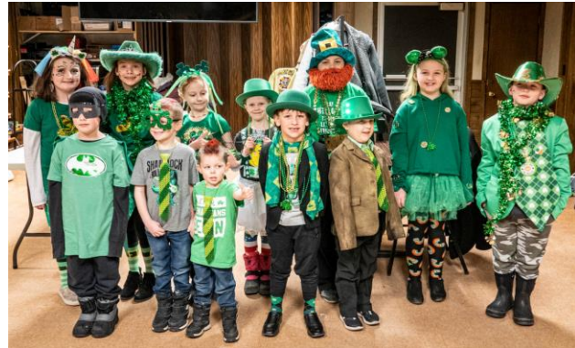
Saturday, March 12, 2022 Downtown Brainerd's St Patrick's Day Children's costume contest held at the VFW