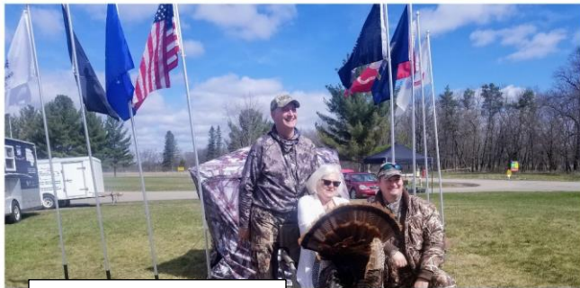
2021 Turkey Hunt