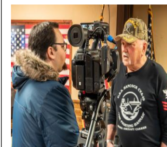
The Vietnam War Veterans Recognition Act of 2017 established March 31st as National Vietnam War Veterans Day each year.

lptv.org/brainerd-vfw-honors-vietnam-veterans-at-annual-gathering/