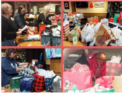
Santa's Giving Tree Elves at work.

12/16 Placing of wreaths – Wreaths for the Fallen at Ft Ripley cemetery.